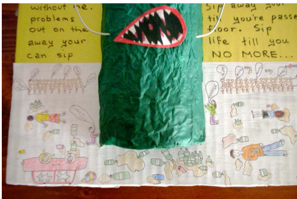
Figure 3. Photograph of Sue's poem (detail)

These small pictures litter the lower third of the text. We see images of people lying insensate among spilt and broken bottles, and what looks like their own vomit. Two figures on their knees worship at the giant bottle's base – one says "I need you", the other says "Master". In the background, ranks of humans, reduced to a mass of anonymous, featureless stick figures, cry "More" and "We need you". We can see from this how different elements of the text modify and elaborate each other and contribute to the text's impact as a unified whole. An example is how the stick figures are arrayed in the background like an army or a gang, or perhaps a congregation, suggesting that alcohol wields the kind of power a cult leader does – an interpretation supported by the worshipping attitudes of other figures in the picture.