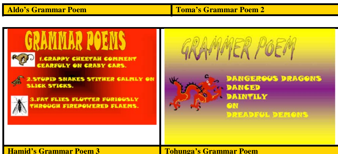
Figure 2. Copy of Restart student's Grammar Poems

For many of these students, schooling has mostly been about “not fitting in”. Even though throughout their years of schooling they’ve been told that they have “progressed” to the next year level, they have found that their literacy practices and ways of being and seeing in the world have become increasingly out of synch with the literacy practices that the school system values and believes they should be able to demonstrate through, reading, writing, listening and speaking. The “ Simpsons Powerpoint animation”, “Grammar Poems”, the “ Shrek ” 3 and “Kidnapped” assignments were projects that we would use in our mainstream Englishes classes. Instead of seeing their abilities as “remedial” and marginalizing them further by forcing them to make sense of schooling through conventional text exercises that focus on what they don’t know, we wanted to privilege their literacy practices, their ways of seeing and being in the world, by giving them opportunities to explore their potentials, by not “dumbing down” their work.