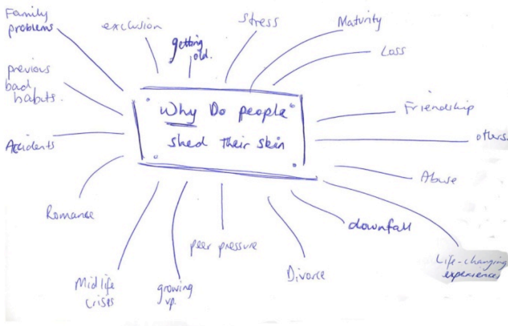
Figure 2. Why do people shed their skin?

In Figure 2 (above) “ Why do people shed their skin?”, one can clearly see how Joanna has generated multiple reasoned catalysts for why people reach points in their