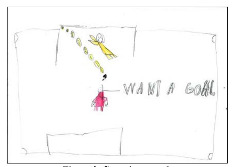
Figure 3. Goran's artwork

Similarly, Goran connected to Mirror through sport, but his motivation comes from the Moroccan side and playing soccer. Goran used pencil and crayon to create his depiction of a shot on goal. A striker in red with his back to the viewer is positioned in front of the goal. The striker is imagining a shot where the ball travels through the air and into the top left corner of the goal. A thought bubble emanates from the striker's head, "WANT A GOAL". Facing the viewer in a yellow uniform is the goalkeeper. Goran has drawn this player flinging his body to the right, arms stretched high in an (unsuccessful) attempt to block the goal. It appears Goran will get his wish.